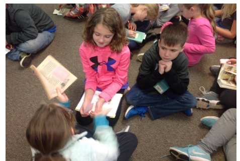
Images of students at Symons engaging in readers workshop! Look at them grow!!